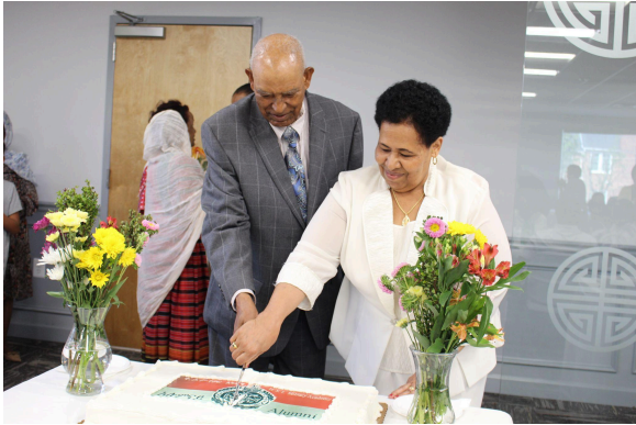
50th Wedding Anniversary