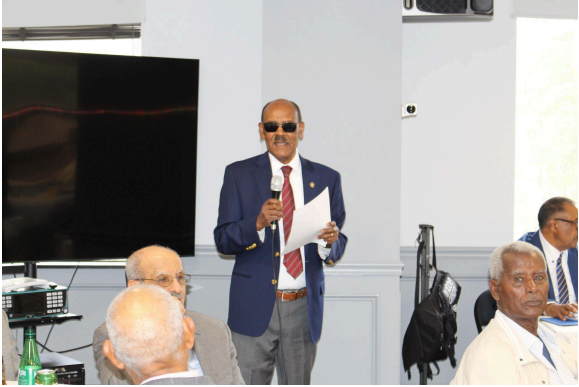
Executive Committee Secretary