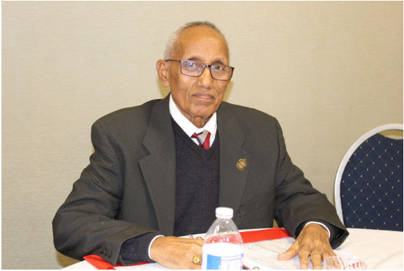
Executive Committee Chairman