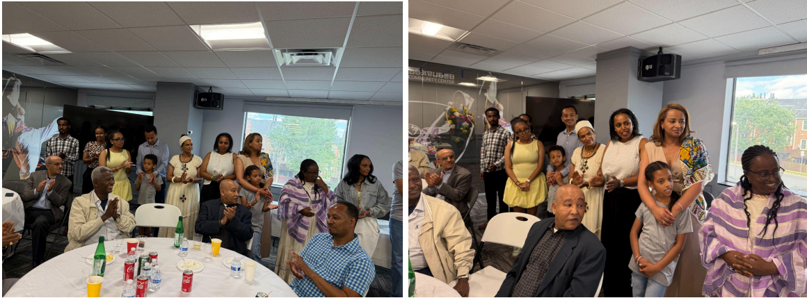
Second Generation Youth